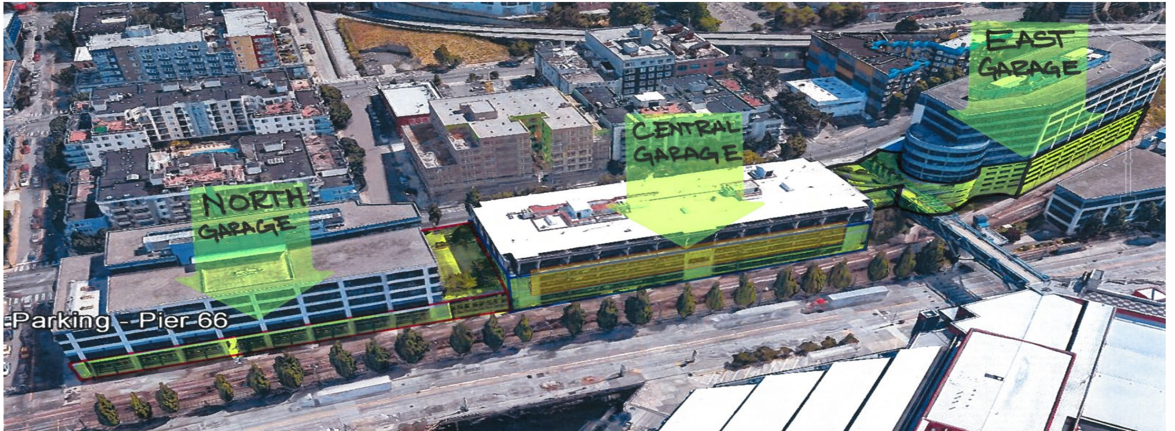
Bell St. Parking Garage